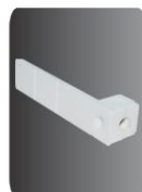
Fixing bolts 裏門固定架 MODEL:LC-S12