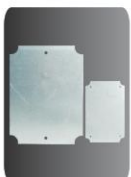
Steel mounting plate 金屬底板 (鍍鋅)