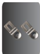
Wall brackets for Plastic box 塑料盒不銹鋼掛牆鉤 MOEDL:WP-02