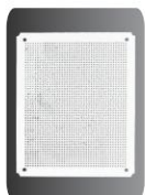
Plastic mounting plate 塑料底板(ABS)