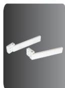
Door hinge fixing piece 裏門鉸鏈固定件 MOEDL:LC-S11